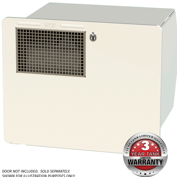
DOOR NOT INCLUDED. SOLD SEPARATELY. SHOWN FOR ILLUSTRATION PURPOSES ONLY.

INDUSTRY EXCLUSIVE FLUE TUBE Baffles - Slows combustion process to transfer more heat to water in tank.